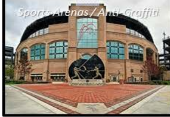
Sports Arenas / Anti Graffiti