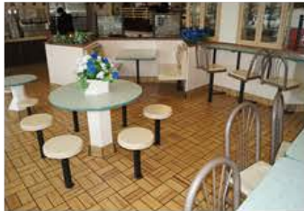
Restaurant / Food Service