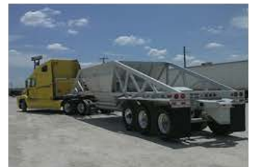
Rail Car / Transport Vehicle