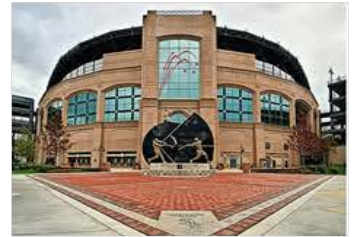
Sports Arena & Anti-Graffiti