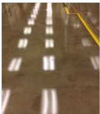
Warehouse / Manufacturing