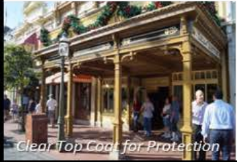
Clear Top Coat for Protection