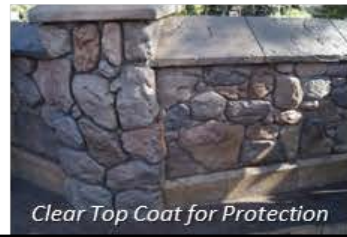
Clear Top Coat for Protection