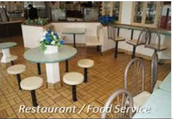
Restaurant / Food Service