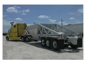
Rail Car / Transport Vehicle