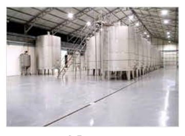
Food & Beverage